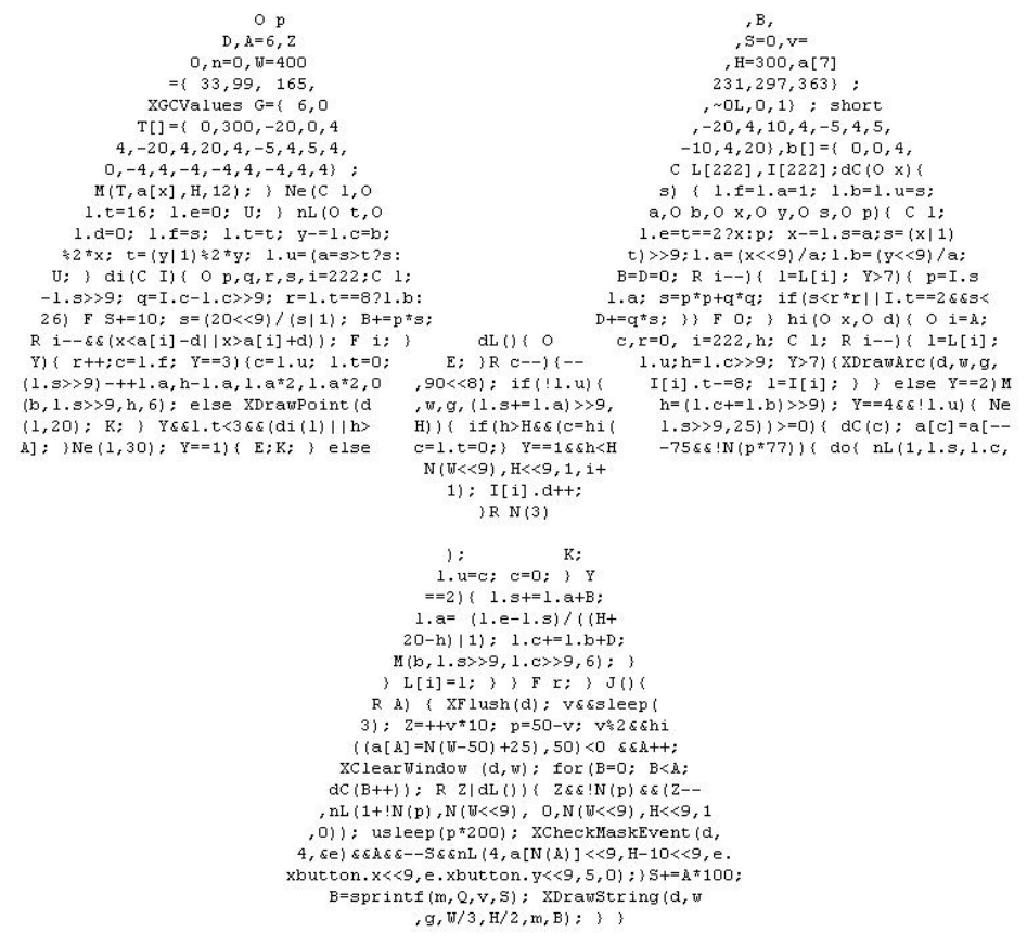
Figure 1: Real C code... but what dialect? Who can understand this?

The purpose of software is to work, of course, but also to clearly communicate the programmer's intentions to maintenance people. Clear communications means we must all use similar dialects. Someone – that's you, boss – must specify the dialect.